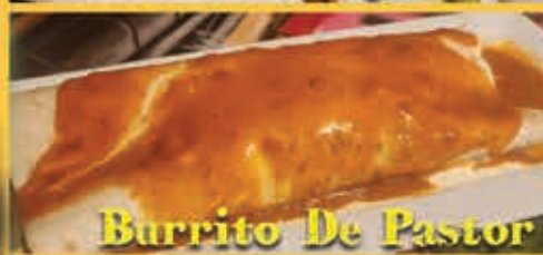
Burrito De Pastor