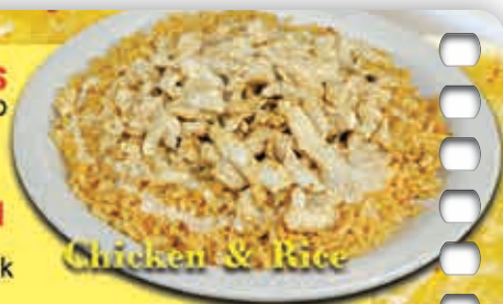
Chicken & Rice