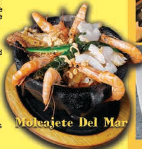
Molcajete Del Mar

Two fillets of tilapia with four grilled shrimp on top. Served Californai vegetables, sour cream and rice. Comes with our house special sauce. 15.99