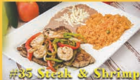
#35 Steak & Shrimp