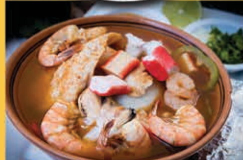
Caldo de Mariscos