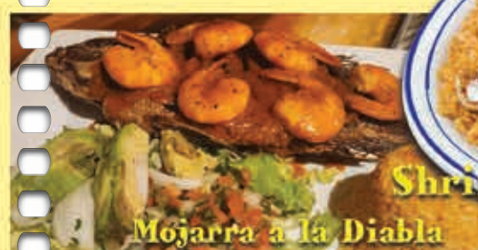
Mojarra a la Diabla