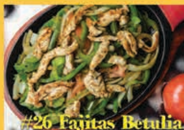
#26 Fajitas Betulia

Steak, chicken, mushrooms, pineapple and melted cheese. For One 18.99 | For Two 31.99