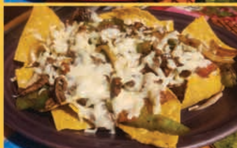
#33 Nachos Mexicanos