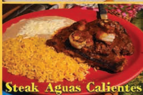
Steak Aguas Calientes