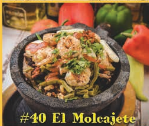
#40 El Molcajete