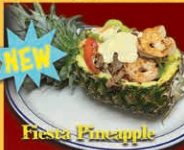
NEW Fiesta Pineapple