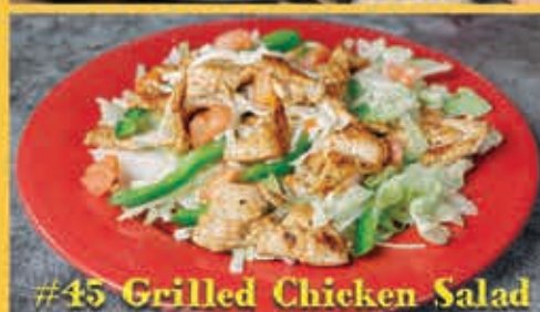
#45 Grilled Chicken Salad