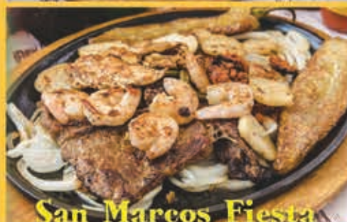
San Marcos Fiesta