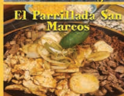
El Parrillada San Marcos