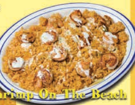
Shrimp On The Beach