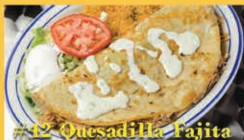
#42 Quesadilla Fajita

Mexican soup filled with chicken, vegetables and tortilla strips. 10.99