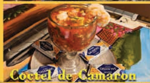
Coctel de Camaron