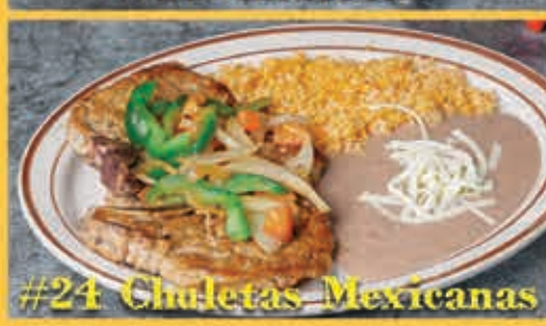
#24 Chuletas Mexicanas

NOTICE: CONSUMING RAW OR UNDERCOOKED MEATS, POULTRY, SEAFOOD, SHELLFISH OR EGGS MAY INCREASE YOUR RISK OF FOOD BORNE ILLNESS. SPECIFICALLY IF YOU HAVE CERTAIN MEDICAL CONDITIONS.