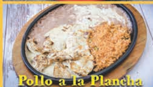
Pollo a la Plancha