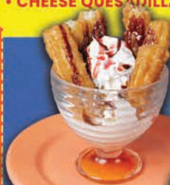
Fried Ice Cream