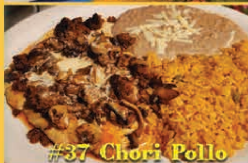
#37 Chori Pollo