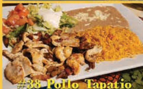
#38 Pollo Tapatio